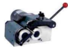
MOTOR PUNCH GRINDER MODEL GIN-PGAM