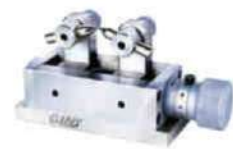
PRECISION DUPLEX DRESSER