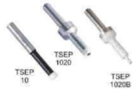
CERAMIC EDGE FINDER