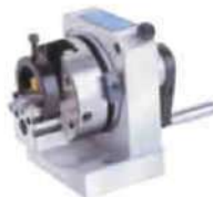
PUNCH FORMER WITH RADIUS DRESSING ATTACHMENT MODEL GIN-PFB