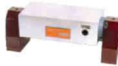
ROTARY PERMANENT MAGNETIC CHUCK