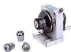
ER COLLET PUNCH FORMER