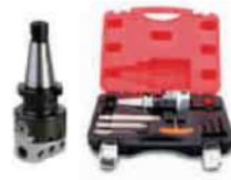
MODEL GIN-BHC3 (SET) WITH THREE NOS. INDEXABLE INSERTS TYPE BORING BARS.