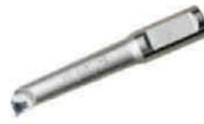
PRECISION BORING TOOLS WITH INDEXABLE CARBIDE INSERTS