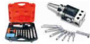
MODEL GIN-BH2084 (SET)