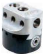
BORING HEAD BHC Series