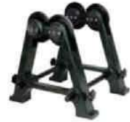
WHEEL BALANCING STAND