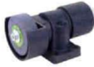
DIAMOND CBN FLAT WHEEL TRUER