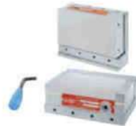
PERMANENT MAGNETIC CHUCK (VERTICAL TYPE)