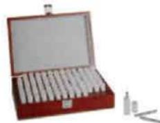
PIN GAUGE SET