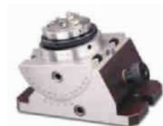
PRECISION UNIVERSAL THIN CHUCK PAEDESTAL