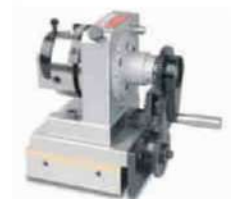
THREAD GRINDING SLIDER