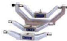
RADIUS DRESSER MODEL GIN-RD40