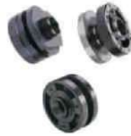
FLANGES FOR GRINDING MACHINES