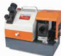
SCREW TAP GRINDER