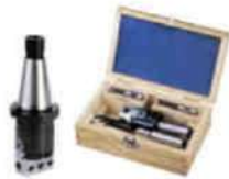
MODEL GIN-BHC2 (SET) WITH THREE NOS. INDEXABLE INSERTS TYPE BORING BARS.