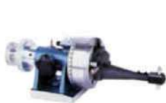
RADIUS AND ANGLE DRESSER MODEL GIN-RDB