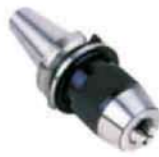
NC DRILL CHUCK - INTEGRATED TYPE