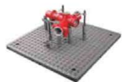
FIXTURES AND ELEMENTS FOR CMM