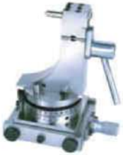
UNIVERSAL WHEEL DRESSER