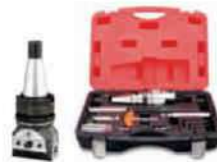
UNIVERSAL BORING AND FACING MASTER HEAD