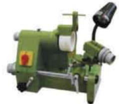
UNIVERSAL CUTTER GRINDER