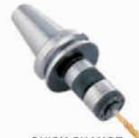
QUICK CHANGE TAPPING CHUCKS