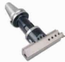
LARGE DIA BORING HEAD