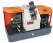
BALL ENDMILL GRINDER