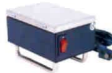
DEMAGNETIZER - HANDY TYPE & STANDARD TYPE