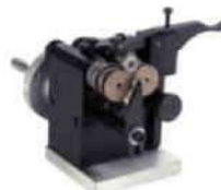
PUNCH GRINDER MODEL GIN-PGAS