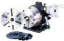
SUPER INDEX SPACER