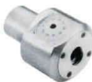
BORING HEAD HIGH PRECISION FOR SMALL DIAMETER