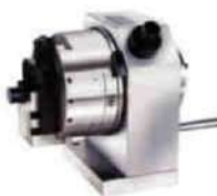
PUNCH FORMER (BIG)