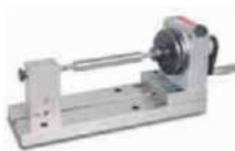
CENTER PUNCH FORMER