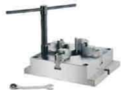
SUPER THIN CHUCKS FOR MILLING