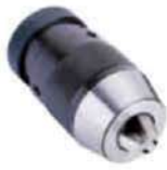
PRECISION KEYLESS DRILL CHUCK