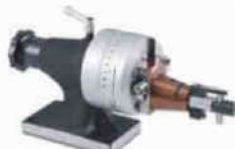
RADIUS AND ANGLE DRESSER MODEL GIN-RDA