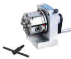
3 JAWS PUNCH FORMER