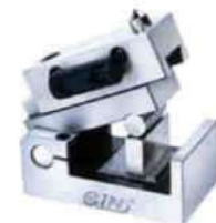
ANGLE SINE DRESSER