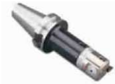
SMALL DIA FINE BORING HEAD