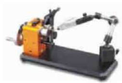
CONCENTRICITY MEASURING INSTRUMENT