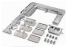
ADJUSTABLE FIXTURES AND VICES FOR WIRE EDM