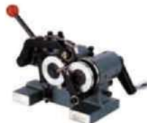
PUNCH GRINDER MODEL GIN-PGA