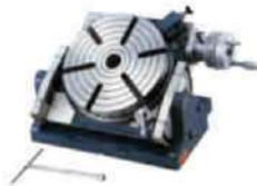
UNIVERSAL TILTING ROTARY TABLE