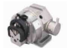
WIRE EDM DIVIDING DEVICE